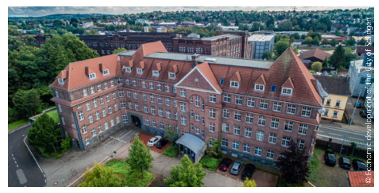
Startup and technology center Solingen

Moreover, Economic development of the City of Solingen is also based at the Startup and technology center Solingen which offers its clients added value with its products.