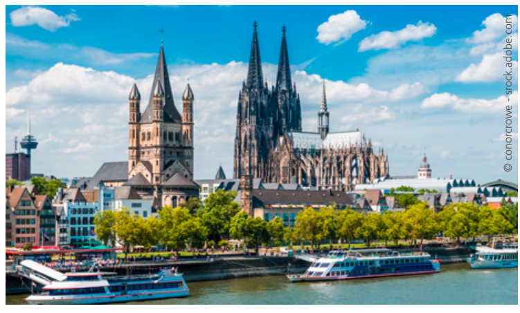
Cologne Cathedral on the Rhine